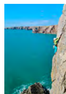
Cover: Kat Dunbar on Warehouse Warriors S 4a Mewsford Point West Face