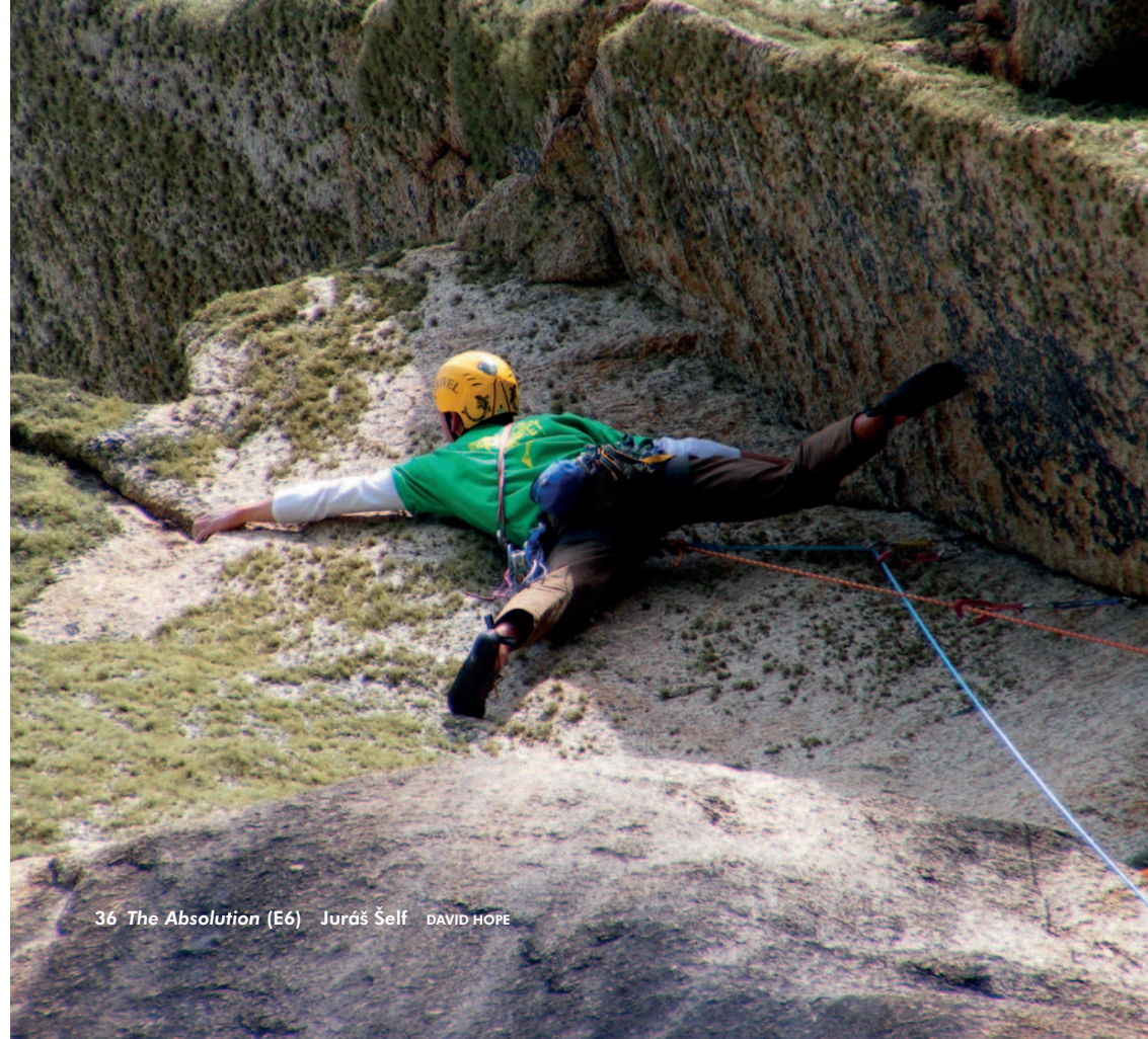
36 The Absolution (E6) Juráš Šelf DAVID HOPE

2 24m 5b Move back right and climb to the overhang. Step left and climb over a bulge with difficulty to a resting place beneath the roofs. Traverse right along the lip of the lower overhang