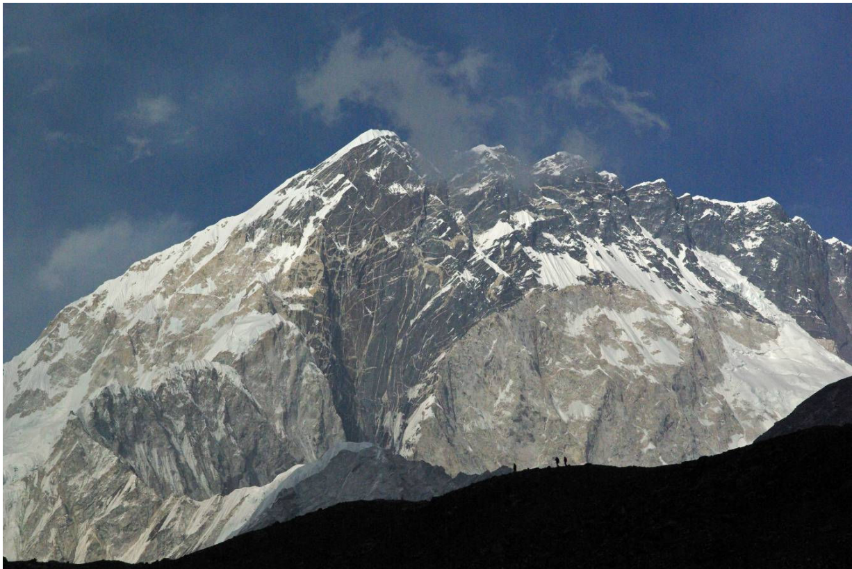
Western flank of Nuptse (Andy Norris)