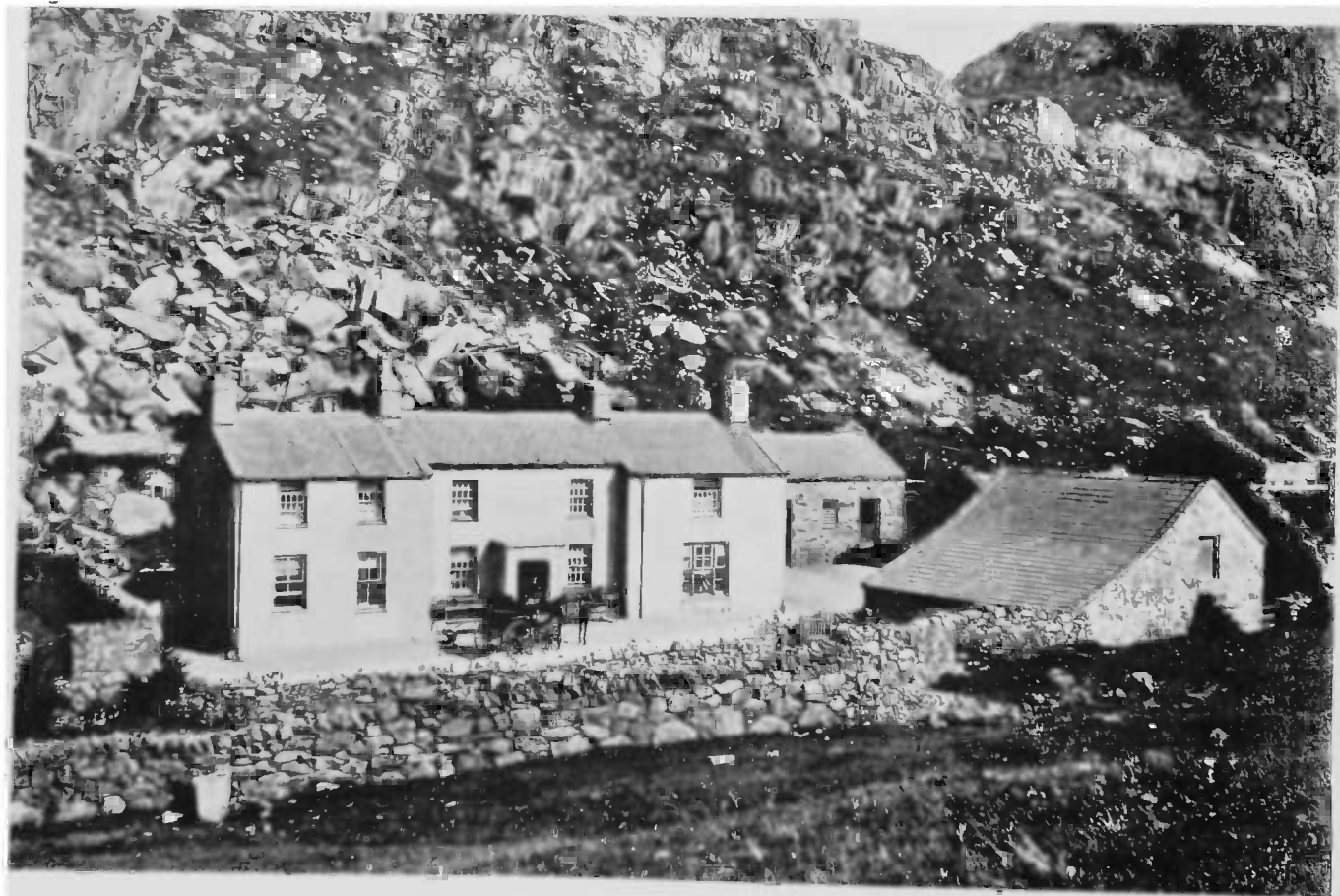
PEN Y PASS IN 1888.