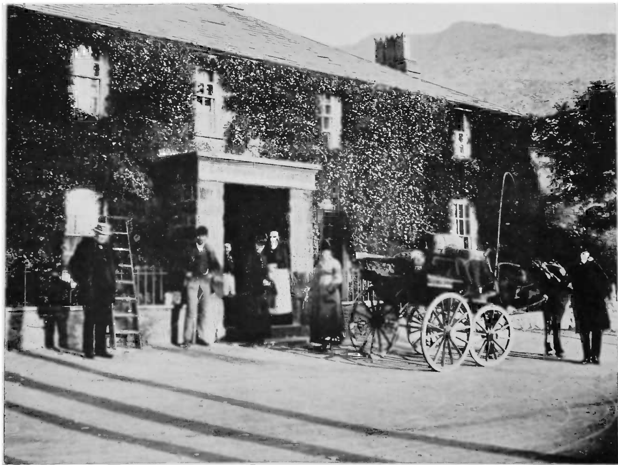
PEN Y GWRYD IN 1888.