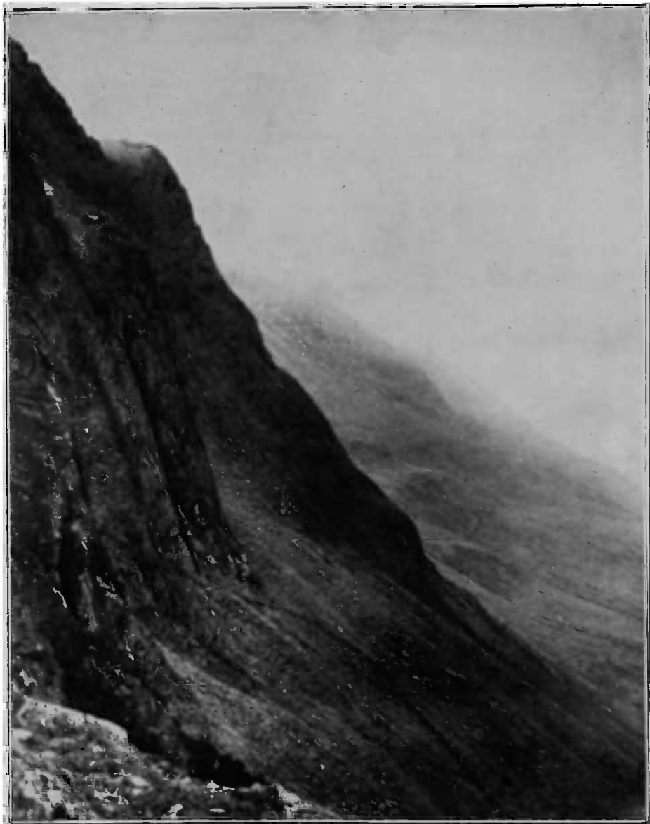
THE HAYSTACKS; FROM GREEN CRAG.