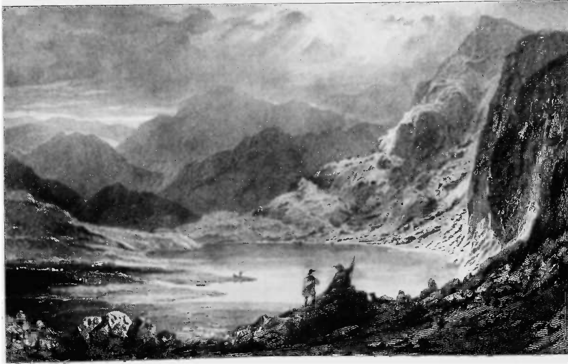
STICKLE TARN, LANGDALE PIKES, FROM PAVEY ARK.